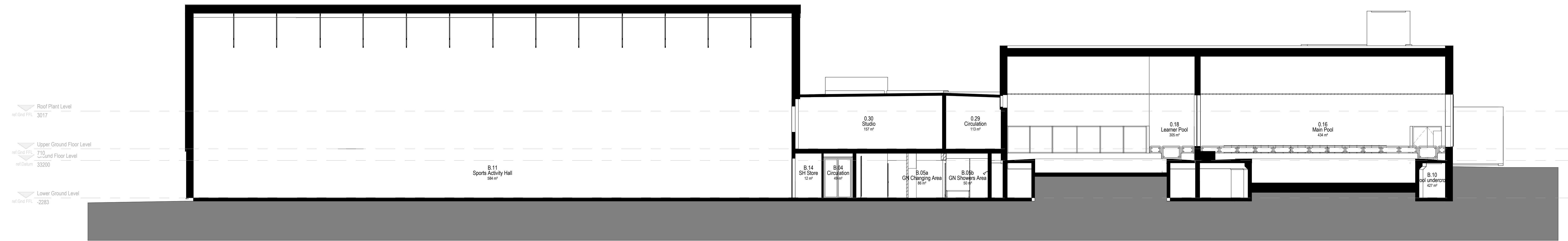
2 Section B - Proposed 1:100