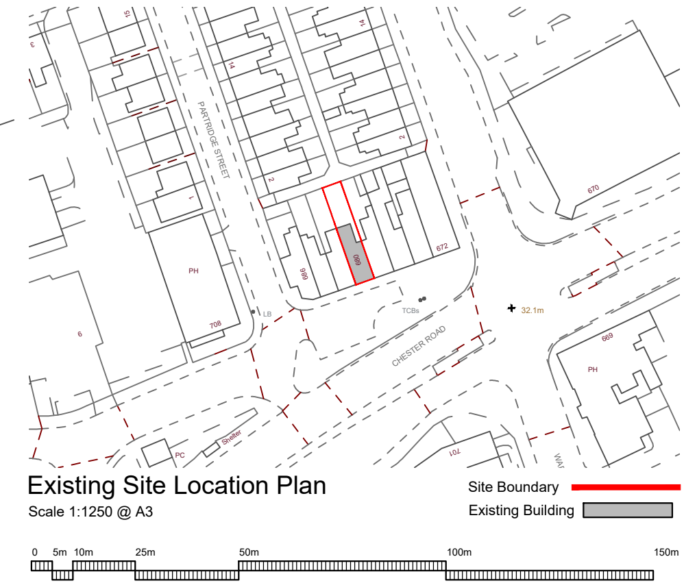
Existing Site Location Plan Scale 1:1250 @ A3